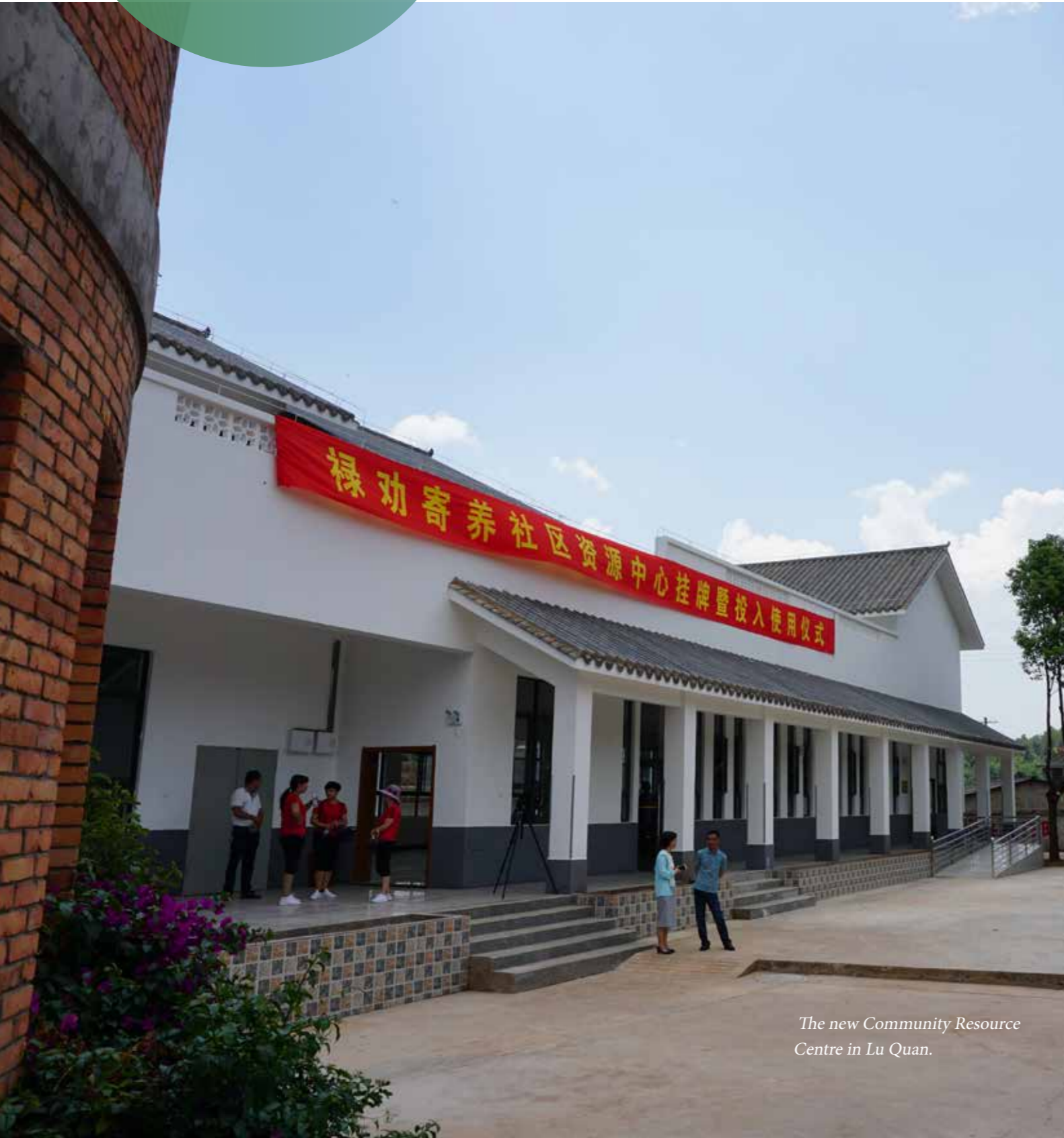
The new Community Resource Centre in Lu Quan.