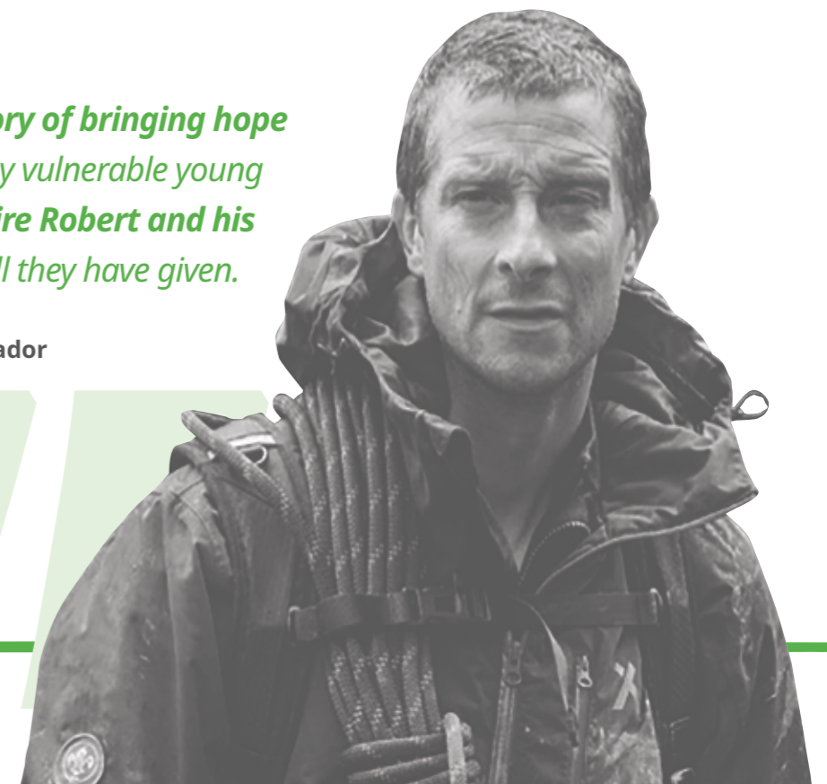
Bear Grylls Care for Children Ambassador