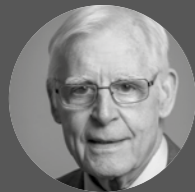
Lord Laming House of Lords